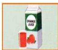
i. orange juice